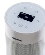
Display view A200