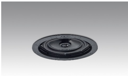
Revox Inceiling I52 without grill