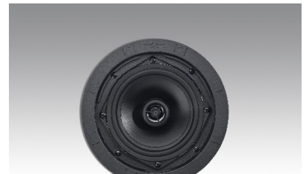
Revox Inceiling I52 without grill