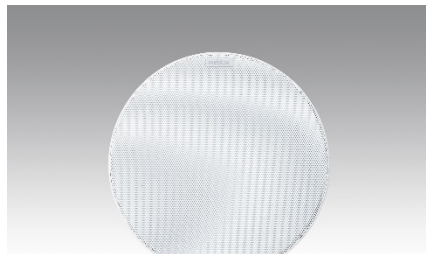
Revox Inceiling I52