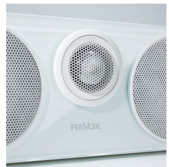
Center G100 chassis