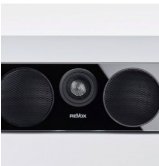
Center G100 chassis