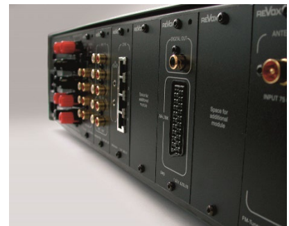
Revox M51 module slots