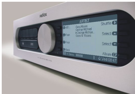
Revox M51 display