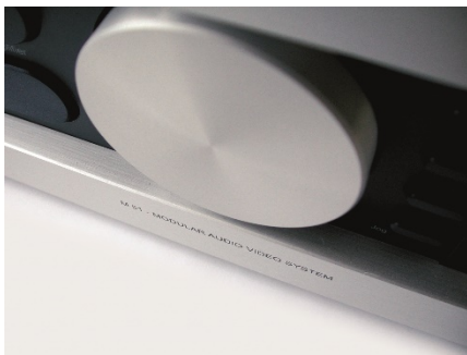
Revox M51 detail

You will find the fundamental idea of modularity has been consistently followed in the two different M51 output options. It is possible to equip your system with an analogue 5 x 60 watt output or the more powerful 5 x 200 watt PWM (Pulse Width Modulation) output for particularly large rooms.