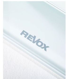
Logo on white glass foot