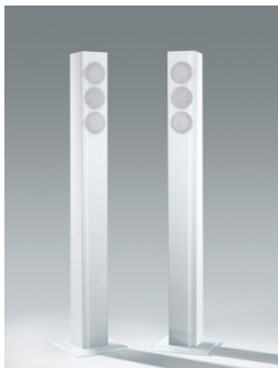
Column G70 white

The elegant column speaker combines slenderness with the highest audio quality, perfectly. No compromises were made on sound during the development: D'Appolito chassis assignment for symmetrical emissions and bass reflex support for a broad frequency range, are just two of the excellent qualities of the Column G70.