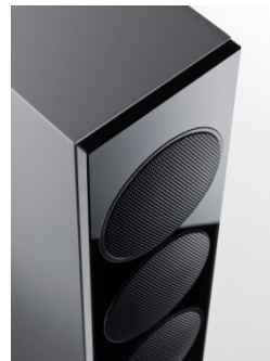
Glass black front