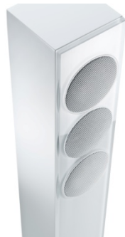
Glass white front