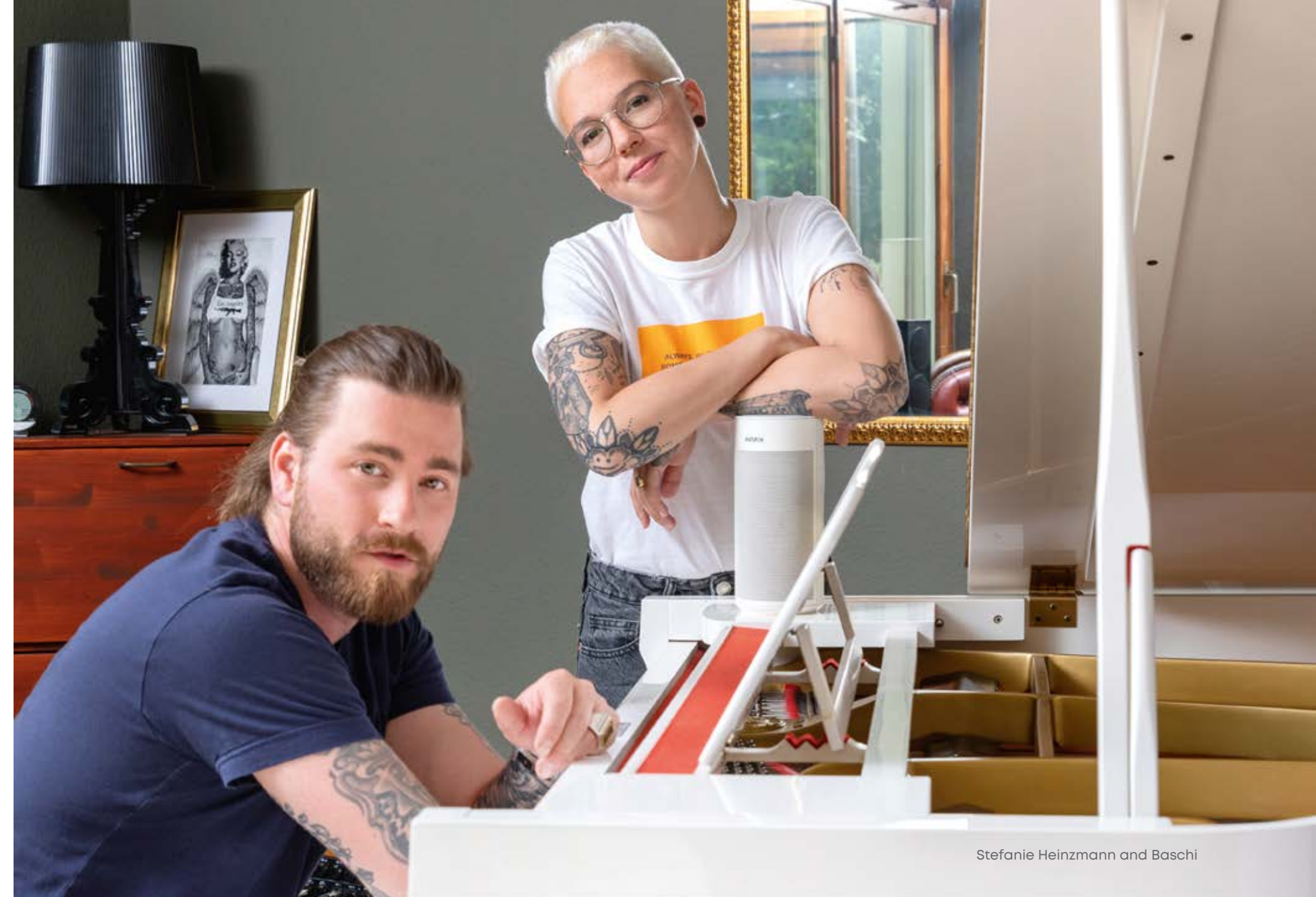
Stefanie Heinzmann and Baschi

Revox is very proud to count not only enthusiastic music lovers but also many well-known musicians worldwide among its customers.