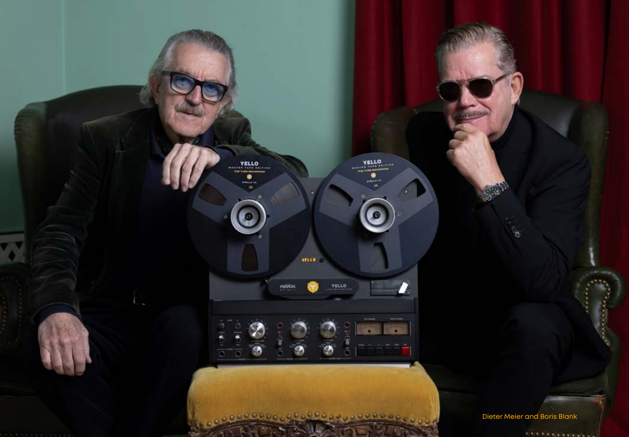
Dieter Meier and Boris Blank